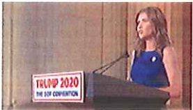
Noem rules out Thune challenge after Trump...

If the vote took place, it would not change the outcome of the election as there is not enough support in the House or Senate for it to be successful.