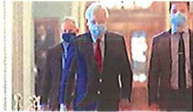
McConnell signals Senate has votes to...

Tuberville's campaign did not immediately respond to a request from comment from The Hill, but earlier this week Tuberville's campaign chairman had said that the senator-elect might back the Brooks effort.