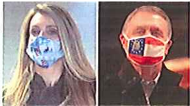
GOP Georgia senators throw support behind...

HP 312X Black Toner Cartridge, High Yield... Sponsored | STAPLES